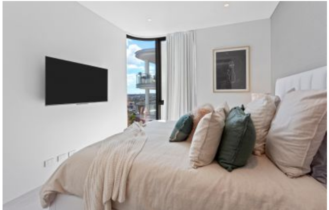
Milsons Point, NSW 1503/61 Lavender Street